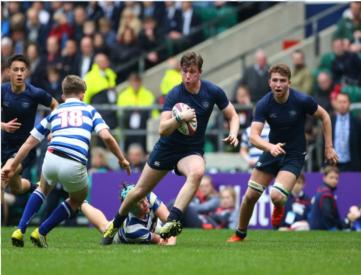
BWS 1 st XV at the NatWest Schools' Cup Final at Twickenham - 29 March 2017

A broad extra-curricular programme helps pupils to understand more of the world, to challenge themselves and to grow as individuals. At Bishop's we aim to provide many and varied opportunities, so that every pupil has the chance to find new interests and achieve great things. Competitive sport is in the lifeblood of the school. Rugby, Cross Country, Athletics, Basketball, Soccer, Hockey and more figure in the sporting calendar, with regular fixtures against schools across Wiltshire and the South West of England. While we are justly proud of our outstanding reputation for sporting success both regionally and nationally, we value equally the commitment of pupils who give their best to an activity they enjoy.