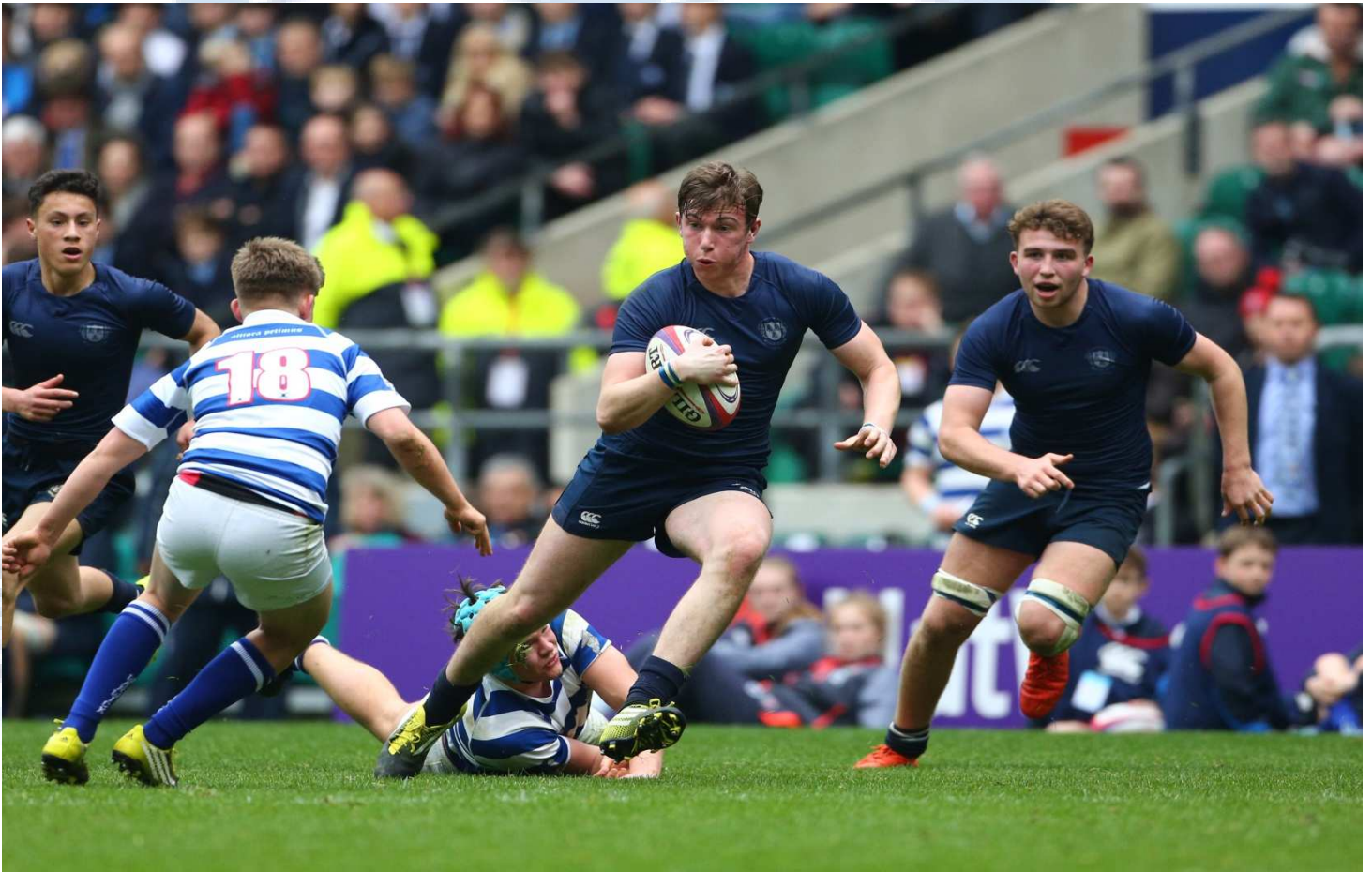
BWS 1 st XV at the NatWest Schools' Cup Final at Twickenham - 29 March 2017

A broad extra-curricular programme helps pupils to understand more of the world, to challenge themselves and to grow as individuals. At Bishop's we aim to provide many and varied opportunities, so that every pupil has the chance to find new interests and achieve great things. Competitive sport is in the lifeblood of the school. Rugby, Cross Country, Athletics, Basketball, Soccer, Hockey and more figure in the sporting calendar, with regular fixtures against schools across Wiltshire and the South West of England. While we are justly proud of our outstanding reputation for sporting success both regionally and nationally, we value equally the commitment of pupils who give their best to an activity they enjoy.