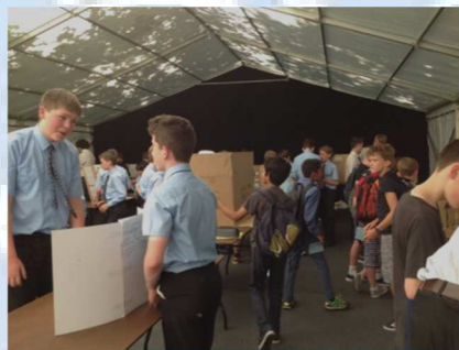
Annual Yr7 Science Fair