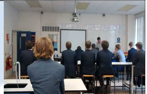
BAYS afterschool talk