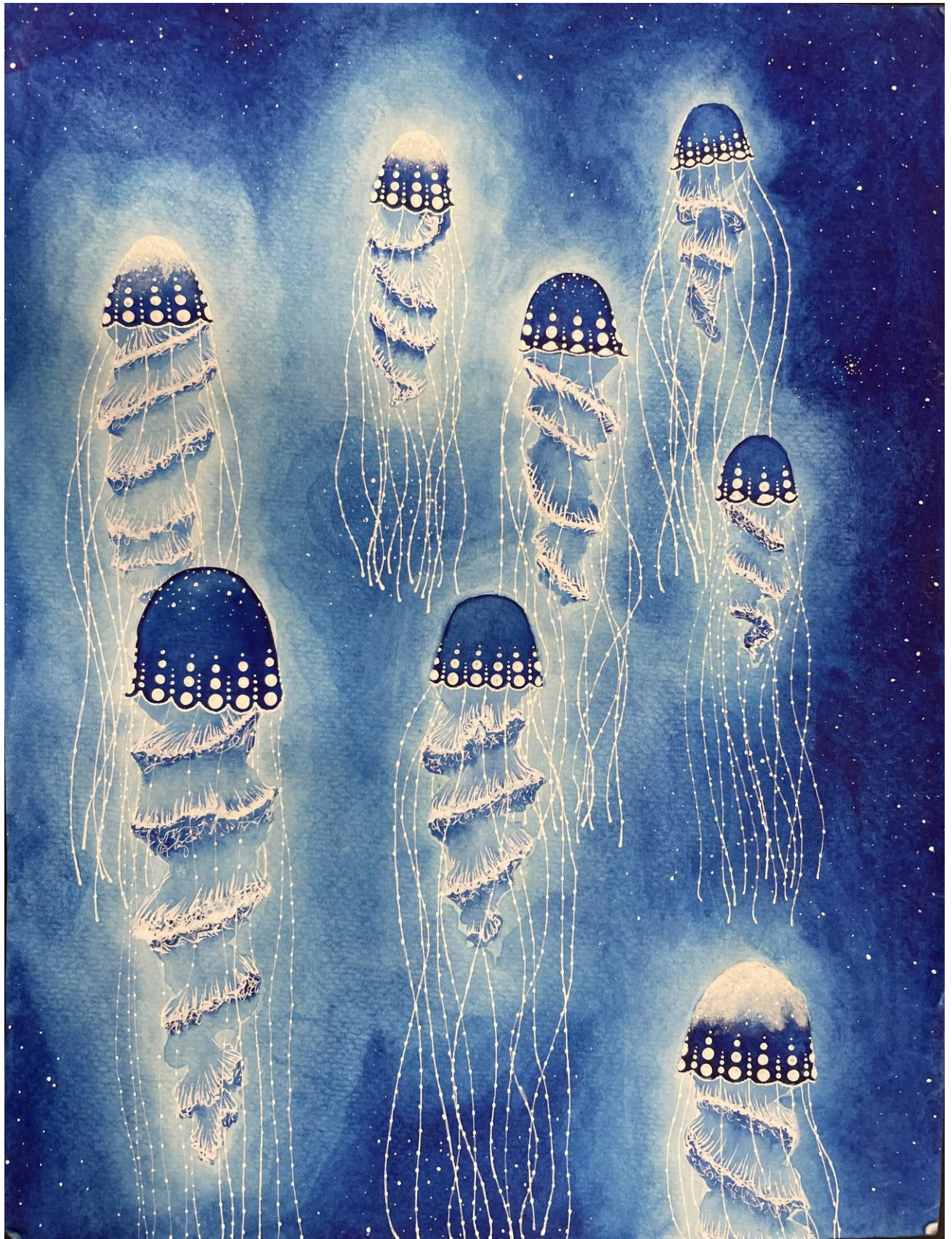
Ellie White - Year 13